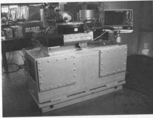
Figure 1: Ultra precise 4-axis machine

Currently research and development is focused on creation and trials of next generation of aerostatic systems with the use of porous throttling, pneumatic-vacuum supports for carriages and spherical supports for spindles, linear and rotary feed drives for ultra precise movement with steps of 1 nanometer, digital tracking of synchronous linear drive, linear axis with “U” shaped non-metallic low vibration synchronous motor.